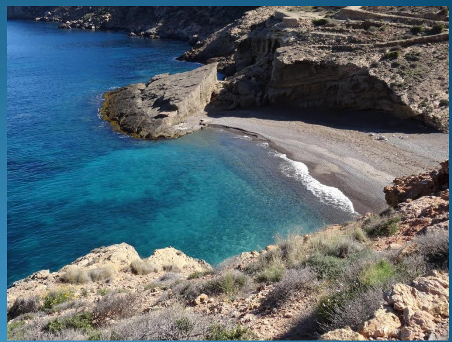
El Portus: Following a course 278° to the West, 4,4 miles from Cartagena, there is a very nice beach known as "El Portus". Nice snorkeling